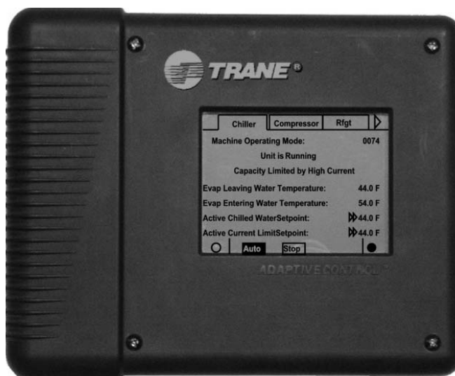
Figure 2 – DynaView Display

Radio buttons show one menu choice among two or more alternatives, all visible. (It is the AUTO button in Figure 2.) The radio-button model mimics the buttons used on old-fashioned radios to select stations. When one is pressed, the one that was previously pressed “pops out” and the new station is selected. In the DynaView model the possible selections are each associated with a button. The selected button is darkened, presented in reverse video to indicate it is the selected choice. The full range of possible choices, as well as the current choice, is always in view.