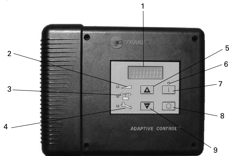
Figure 1 – EasyView Display